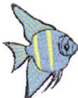
TROPICAL FISH MI0090