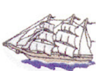
CLIPPER SHIP MI0097