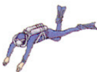
SCUBA DIVER MI0104