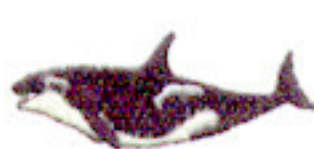
KILLER WHALE MI0107