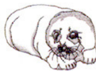
HARP SEAL MI0115