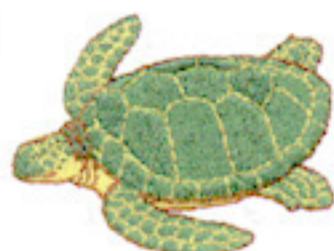
SEA TURTLE MI0117