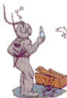
DEEP SEA DIVER MI0098