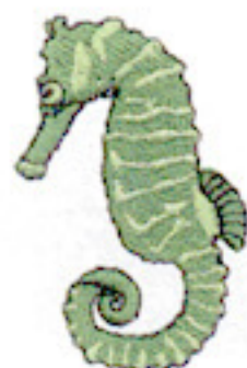
SEA HORSE MI0099