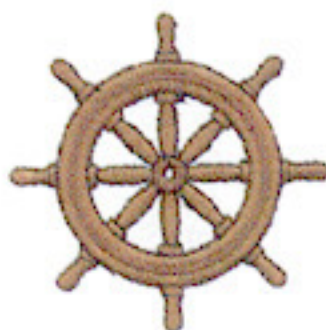
SHIP'S WHEEL MI0092