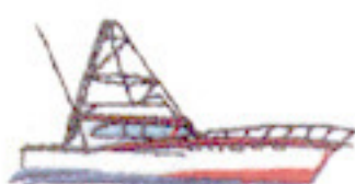
FISHING BOAT MI0094